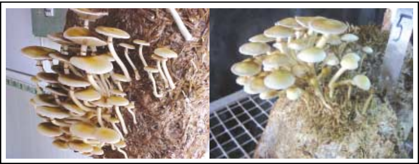
Crop ready to harvest

Small primordia start appearing after 5-8 days after opening the bags which become ready to harvest in the next four days. Average weight of a single fruit body is 3.5g. The fruit bodies could be sun dried or could be stored