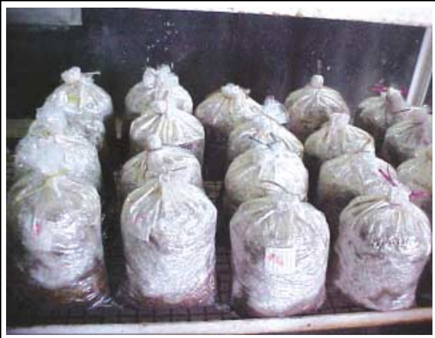
Spawn run bags

Once the mycelium has fully colonized the substrate and formed thick mycelial mat it is ready for fruiting. Contaminated bags with mould may be discarded while bags with patchy mycelial growth may be left for few more days to complete the mycelial growth. At this stage the bags should be opened. A temperature of 25-28°C and RH 80-85 per cent are maintained. Good fruit bodies are encouraged to form by adjusting the humidity in the room and by correct moisture content of the substrate.