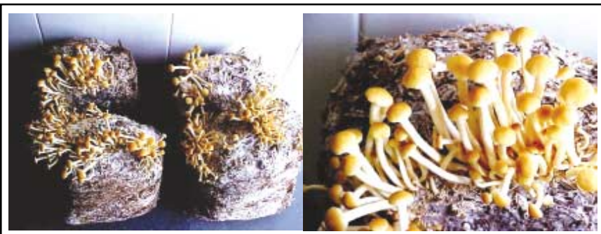
Developing fruit bodies

Once the mycelium has fully colonized the substrate and formed thick mycelial mat it is ready for fruiting. Contaminated bags with mould may be discarded while bags with patchy mycelial growth may be left for few more days to complete the mycelial growth. At this stage the bags should be opened. A temperature of 25-28°C and RH 80-85 per cent are maintained. Good fruit bodies are encouraged to form by adjusting the humidity in the room and by correct moisture content of the substrate.